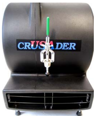
Shown with Optional #2424 Carpet Clamp and Standard Adjustable Front Legs