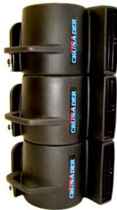
3 of the 3500 Series Airmovers shown stacked for storage