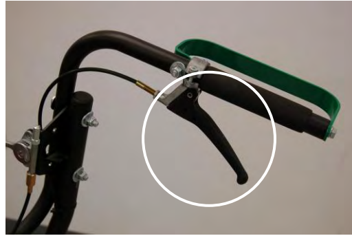
Forward Drive Lever (right hand)