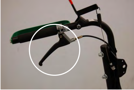
Reverse Drive Lever (left hand)