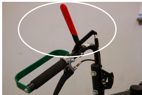
Blade Clutch Lever