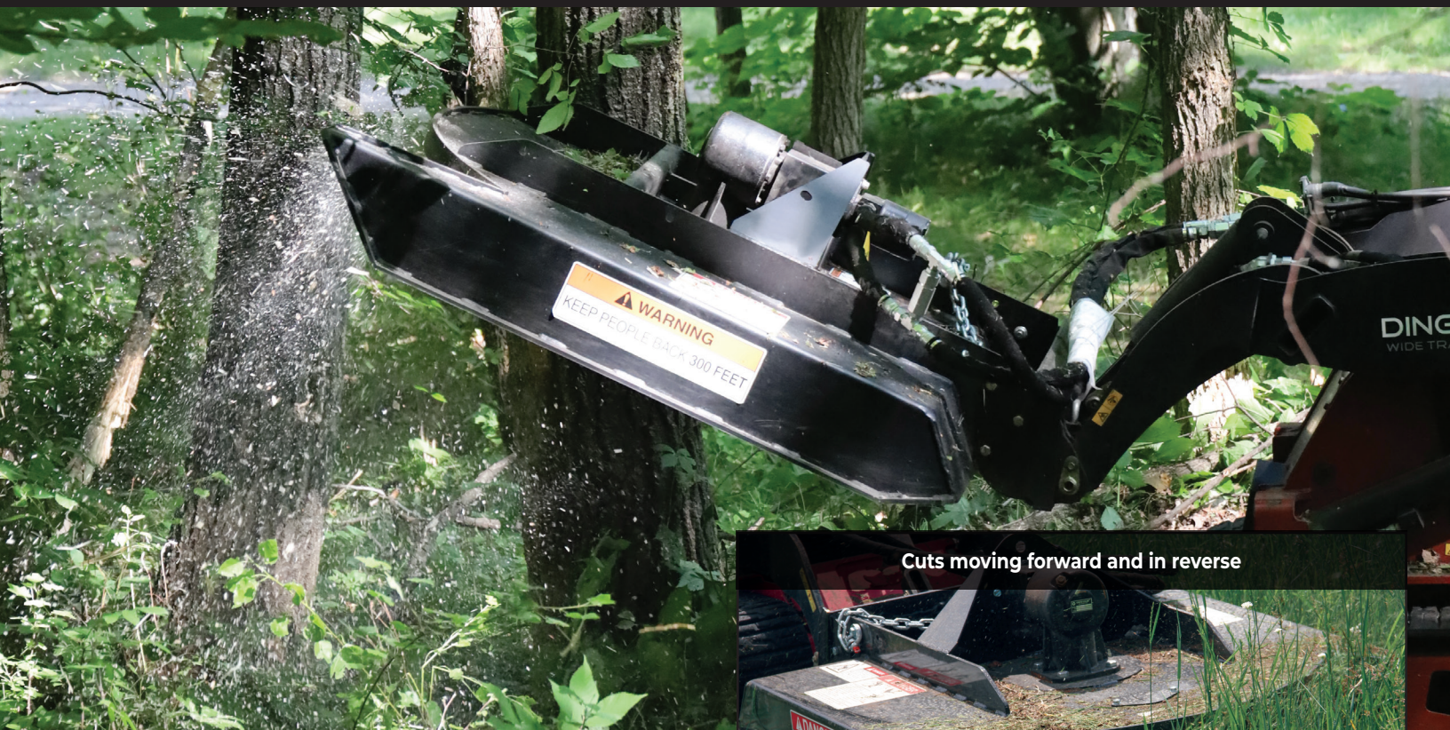
Cuts moving forward and in reverse

The Mini Rotary Brush Mower has been engineered for rugged durability, safety, and ease of operation. Industrial built 7 gauge steel design makes it one of the strongest, most versatile brush mowers made for cutting trees, brush, and unwanted weeds.