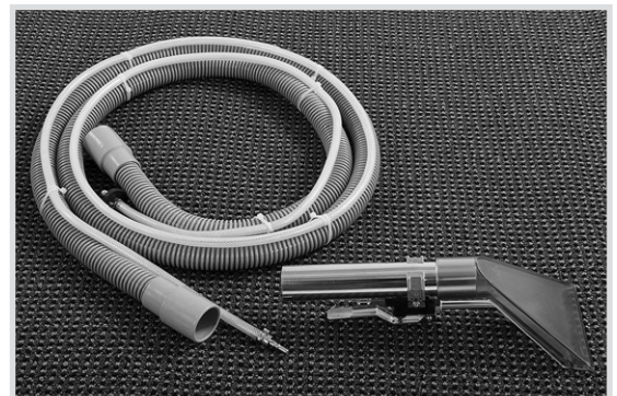
8 foot hose and clear hand tool.