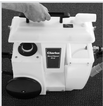
Recovery tank conveniently empties and can be rinsed.

The BEXTSpot Pro® provides a compact, lightweight highly portable tool for quick carpet or upholstery spot clean-up. With a 1 gallon tank, there is plenty of solution capacity for the emergency small jobs that present themselves in schools, offices, food service areas or healthcare facilities. With a powerful pump and vacuum motor, this very convenient machine gets the job done fast, and can then be stored away out of sight.